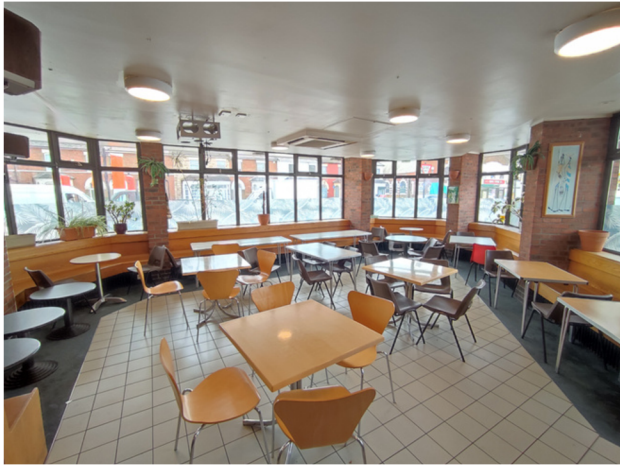
The Coffee Bar