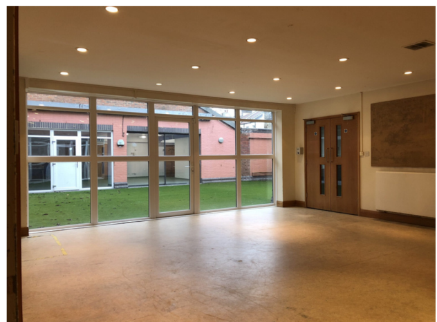
The Heronry Room