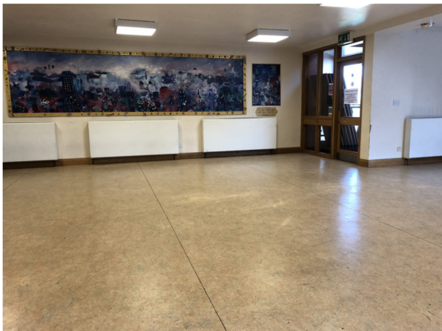
The Gandhi Room