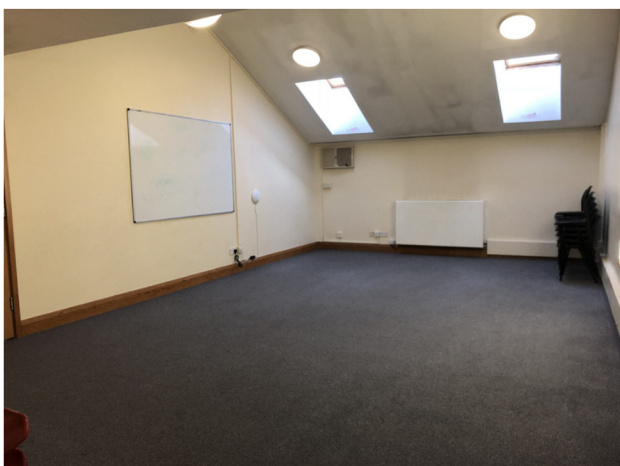
The Hart Room