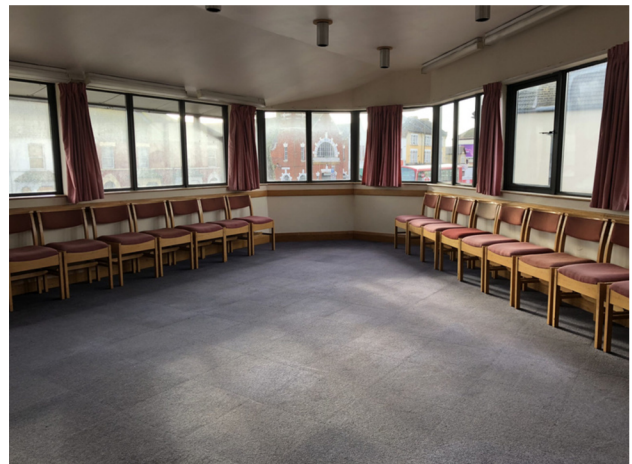
The Webb Room