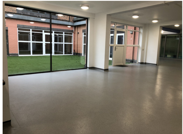
The Activity Space